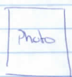
Photo Name Sheriff Seminole County